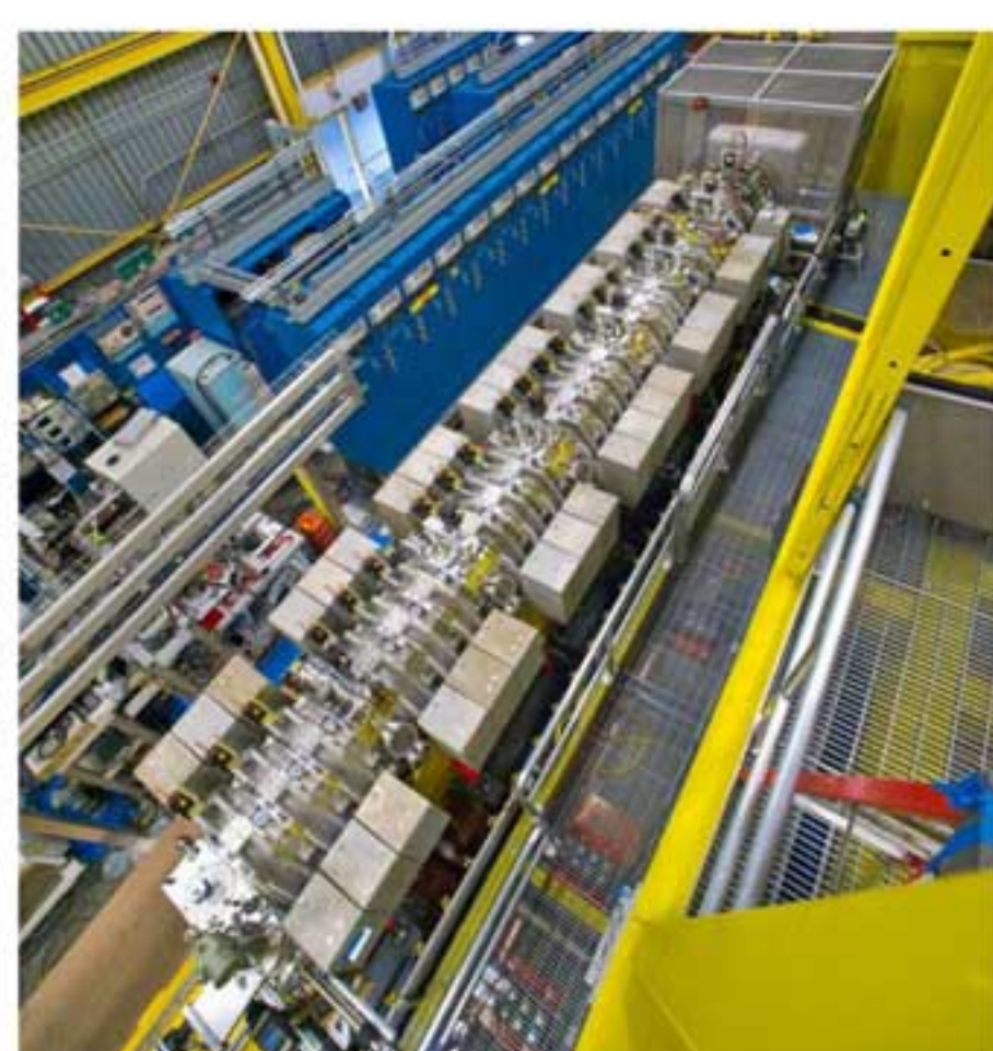
Heavy ion fusion test accelerator in the US