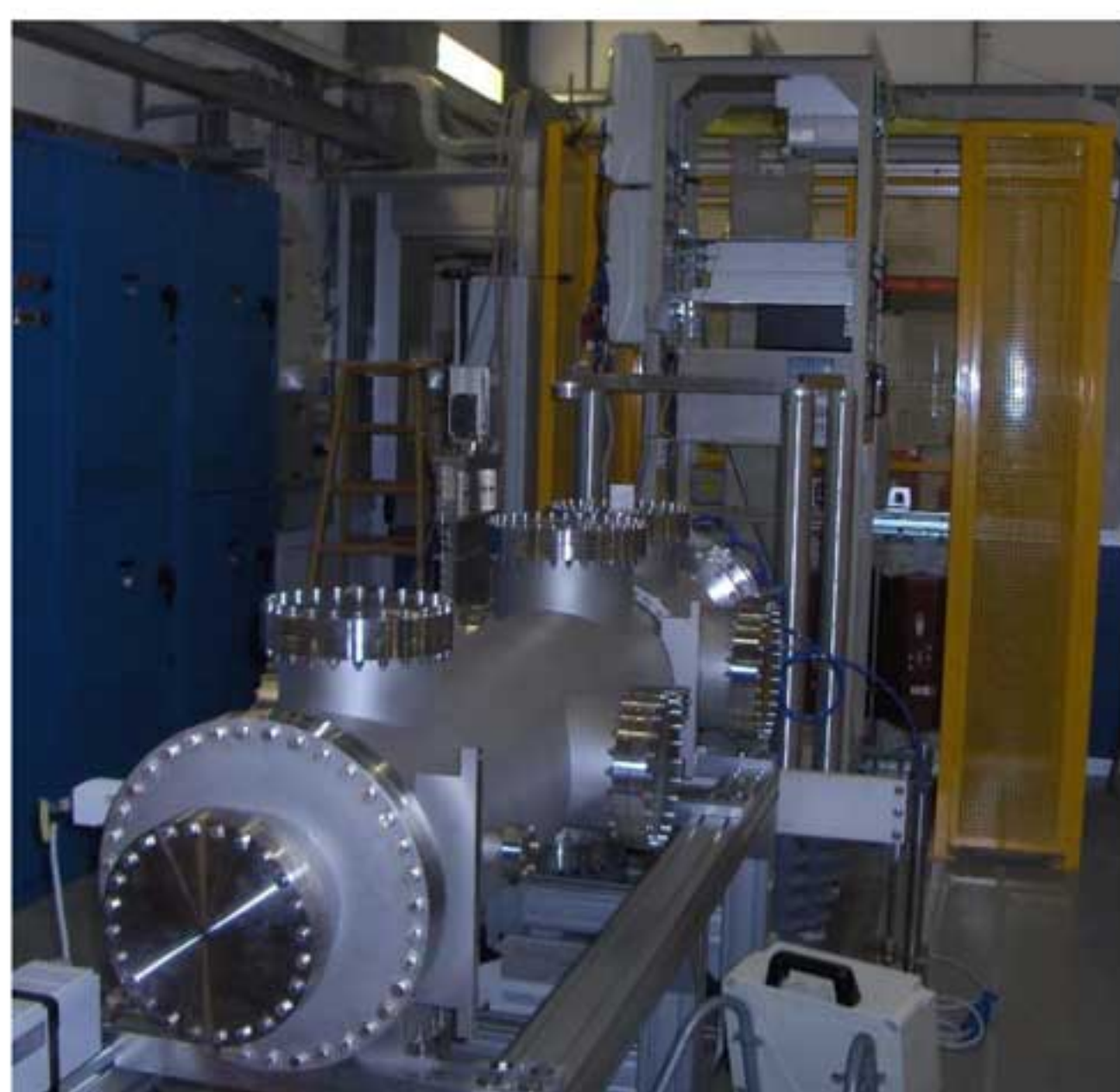
Test facility for a neutral ion source in Italy.

Fusion works by bringing together two forms of hydrogen, deuterium and tritium. For efficient energy production, these must be heated to high temperatures and compressed. In the most commonly studied technique, they must be heated to 100 million °C and confined using a strong magnetic field. It is envisaged that accelerators will contribute to the heating by providing extraordinarily high currents of neutral ions, more than 100000 times bigger than used in ISIS, but at much lower beam energies.